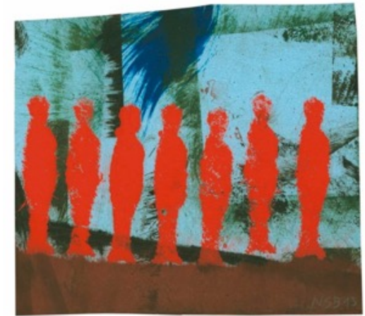
Spiritual Care und Psalmtherapie

The ecclesial endeavor is located at the center of one of the focus areas of the big challenges the European Commission (2015) calls “Personalizing health and care.”