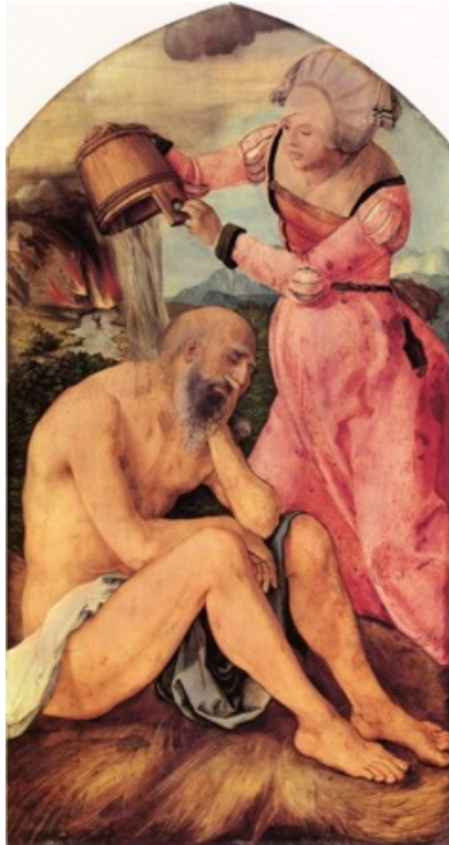
Albrecht Dürer um 1500

Shortage of healthcare professionals and family caregivers (PePA)